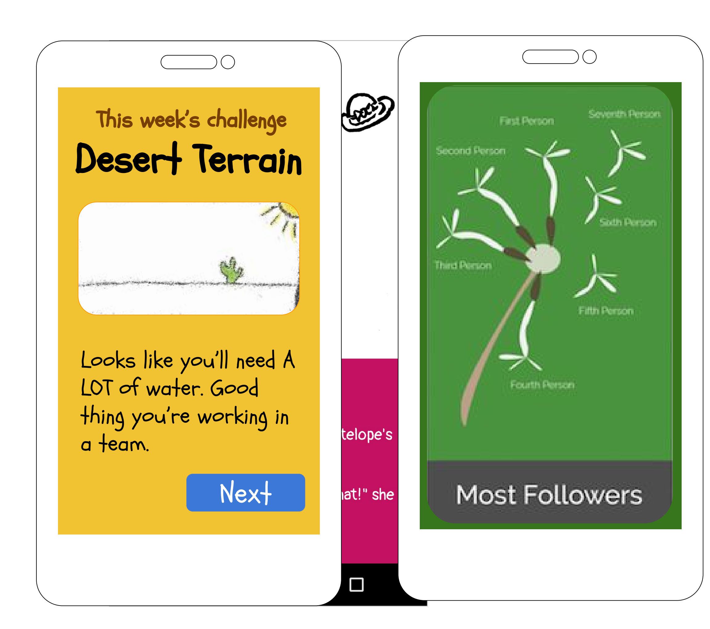
Figure 1. Mobile Applications in our studies: Family physical activity app (left), Prototype of the exergame for Alzheimer's caregivers app (center), Youth activism app (right).